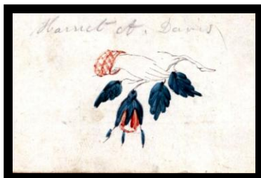
(FIG.5 ) Calling card of hand with rose, collection of author

fracturs as a design theme for birth registers, and wedding certificates.