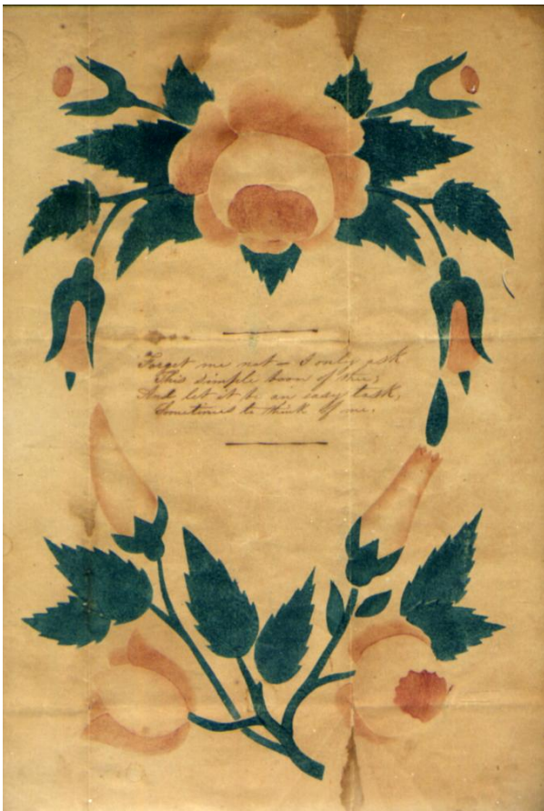
(FIG 4 Watercolor theorem on paper, collection of author) The theorem painted valentine illustrated reads:

Forget me not ~ I only ask, this simple boon of thee; And let it be an easy task, Sometimes to think of me.