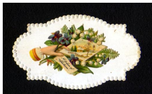
(FIG.6) Hand-embossed chromolithograph Calling Card @ 1870, collection of author